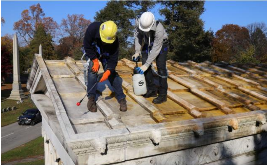
Cleaning a roof as part of the Woodlawn Bridges to Crafts Careers Preservation Training Program Woodlawn (Woodlawn Cemetery & Conservancy)

In 2015, the Woodlawn Conservancy partnered with the International Masonry Institute of the Bricklayers and Allied Craftworkers Local 1 union to establish the PTP, which was sponsored by the World Monuments Fund , called the Bridge to Crafts Careers . Since then, 83 young adults have participated within the program.