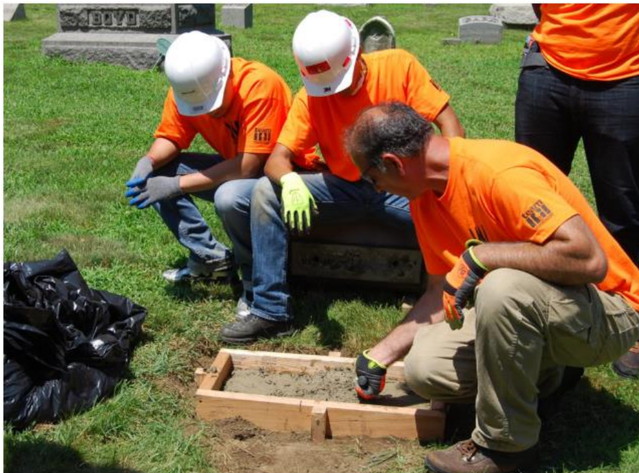
Trainees working with a resident craftsman (Cleaning a roof as part of the Woodlawn Bridges to Crafts Careers Preservation Training Program)

In 2015, the Woodlawn Conservancy partnered with the International Masonry Institute of the Bricklayers and Allied Craftworkers Local 1 union to establish the PTP, which was sponsored by the World Monuments Fund , called the Bridge to Crafts Careers . Since then, 83 young adults have participated within the program.