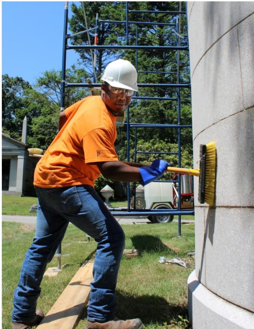
A Woodlawn Preservation Training Program intern practices his restoration skill on an historic monument at Woodlawn.